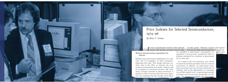
Photo. Interop computer show attendees congregate at the X.400 Apple booth. Rob Crandall, Alamy Stock Photo, 1992.

A 1994 surge in computerrelated goods is reflected in third- and fourth-quarter GDP. In 1995, domestic shipments of memory chips are $11.1 billion as computers continue sparking changes in global financial markets.