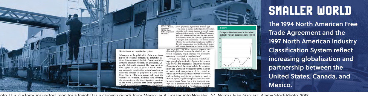
Photo. U.S. customs inspectors monitor a freight train carrying goods from Mexico as it crosses into Nogales, AZ.

Photo. Interop computer show attendees congregate at the X.400 Apple booth.