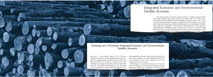
Photo. Harvested timber, like these trimmed logs near Eureka, CA, are among the natural assets in "green" gross domestic product (GDP) estimates.

On Earth Day 1993, the President prioritizes "green GDP" to measure the costs of investing in and depleting environmental assets. Work begins on the Integrated Economic and Environmental Satellite Accounts, intended to supplement the national accounts but later discontinued.